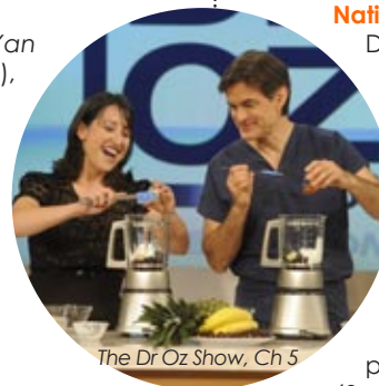
The Dr Oz Show, Ch 5

Australian drama series Sea Patrol season 4 (10am-11am), about a Royal Australian Navy crew. The show chronicles sea crimes the crew faces in protecting and defending Australia's watery borders.