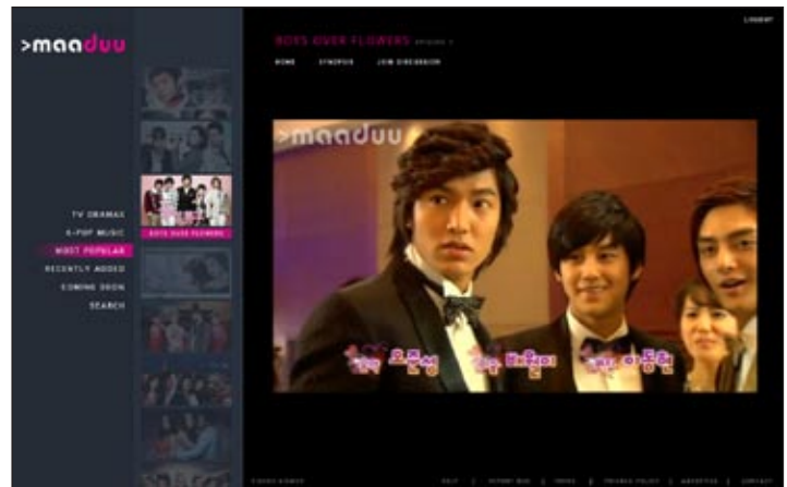
Maaduu's screen interface, showing Korean drama Boys Over Flowers

How many titles do you offer at any one time? "About 120+ titles or 1,000+ hours of KBS and 1,000+ hours of MBC dramas on-