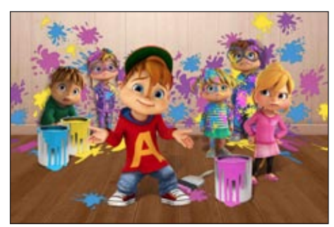
Alvinnn!!! and The Chipmunks

Nickelodeon premieres the return of Alvin and the Chipmunks to television after 20 years in new series, Alvinnn!!! and The Chipmunks, on Friday, 8 May at 6.50pm (HK/Singapore). The 52-part