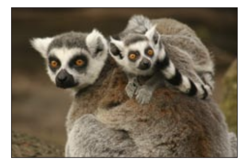
Madagascar's Legendary Lemurs

The first three titles are natural history specials Fur Seals: Battle for Survival, Japan's Wild Year and Madagascar's Legendary Lemurs. NHNZ launched The Archive Unit in 2014 and signed 16 hours of co-production with National Geographic Wild U.S. and International.