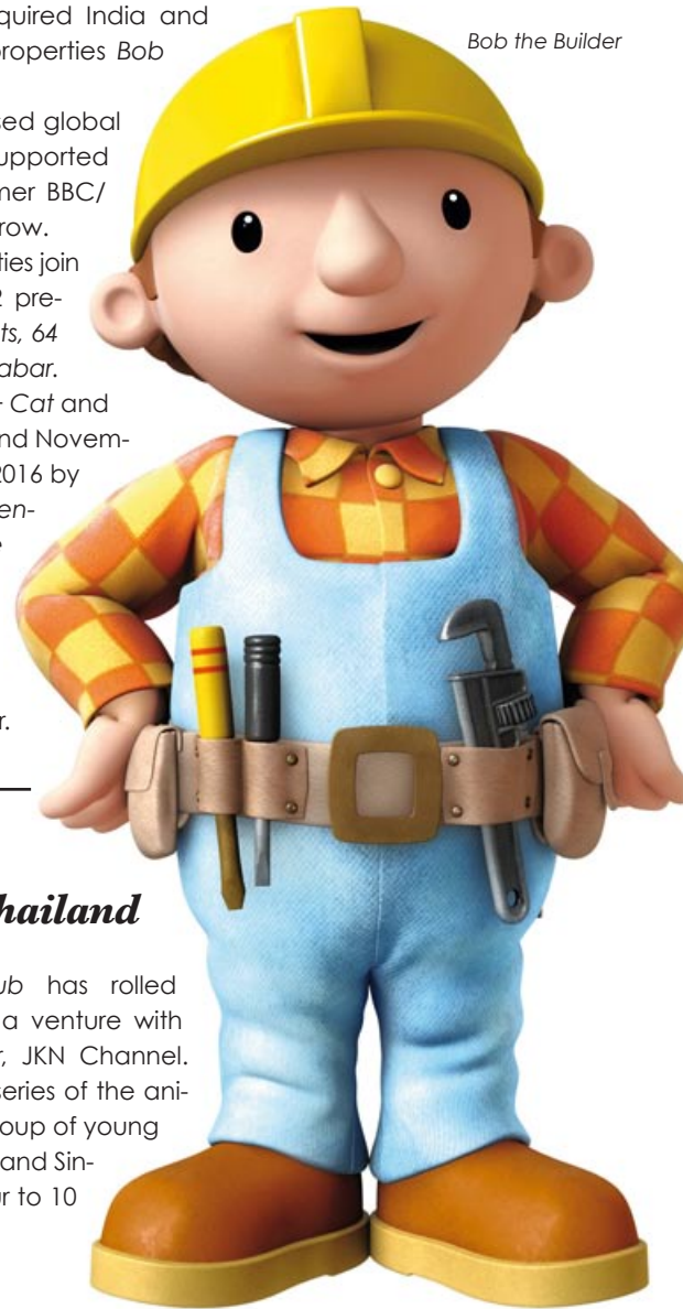
Bob the Builder

Rainbow's Winx Club has rolled out across Thailand in a venture with free-TV satellite programmer, JKN Channel. The Thai debut begins with the fourth series of the animated property. Winx Club , about a group of young fairies, airs in Malaysia, Vietnam, China and Singapore. The series targets girls from four to 10 years old.