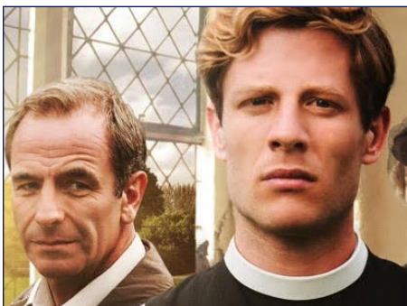
Robson Green (left) and James Norton

U.K. entertainment service ITV Choice has put period detective series Grantchester , starring James Norton and Robson Green as unlikely partners, at the top of its Christmas line up for Asia and the Middle East. The first and exclusive broadcast is on Friday, 18 December.