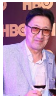
Boldkhet, Supervision Mongolia