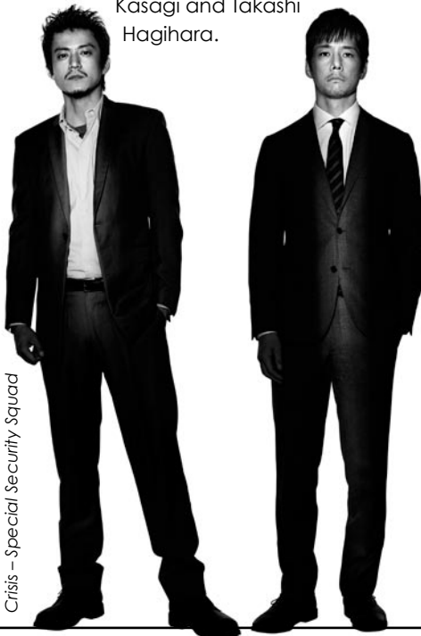
Crisis – Special Security Squad