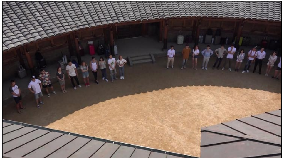
The Society Game , season one

Endemol Shine Group and CJ E&M have renewed their first co-developed format, The Society Game , for a second season.