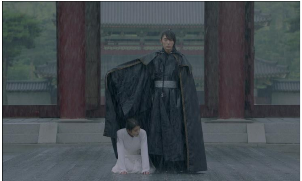
Moon Lovers: Scarlet Heart Ryeo

CJ also has a production relationship with mainland China's Huace Media,