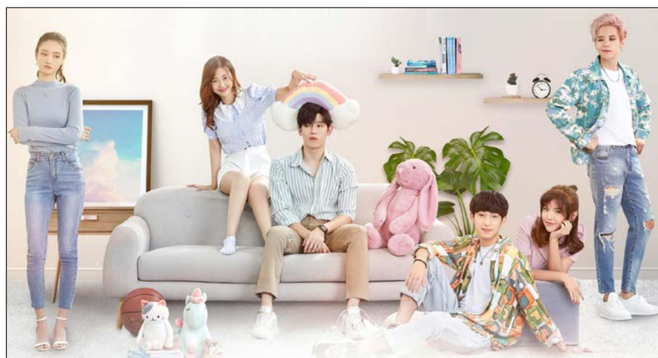
WeTV Original, Put Your Head on My Shoulder

lenges, he layered the unknowns of creating a new kind of content.