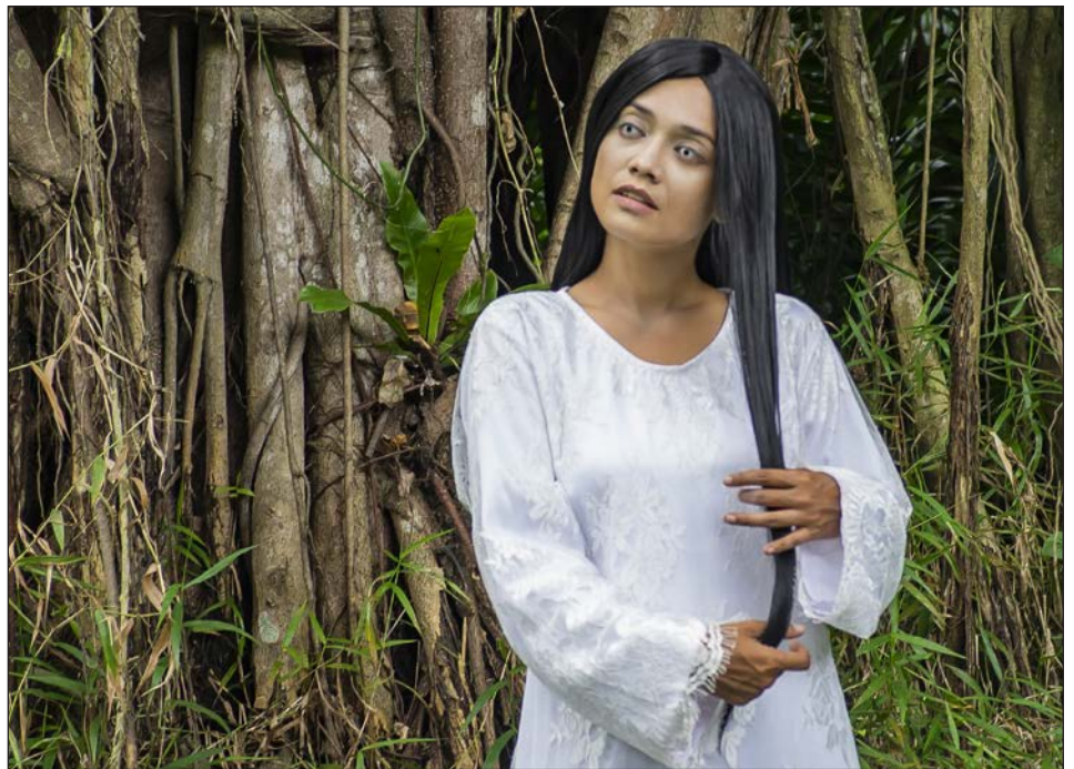
After Dark: The Promise

Singapore Mediacorp's new original production with global storytelling platform Wattpad Webtoon premiered at the weekend, adding another horror anthology to Asia's content landscape.