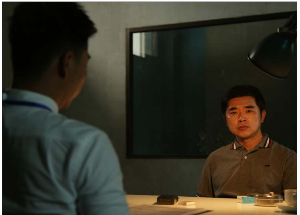
Recreation of Tse Chi Lop in interrogation room with Hong Kong Police after arrest in Hong Kong in 1998

Discovery Asia Pacific adds the story of drug lord Tse Chi Lop to the platform's global streaming slate on 14 November.