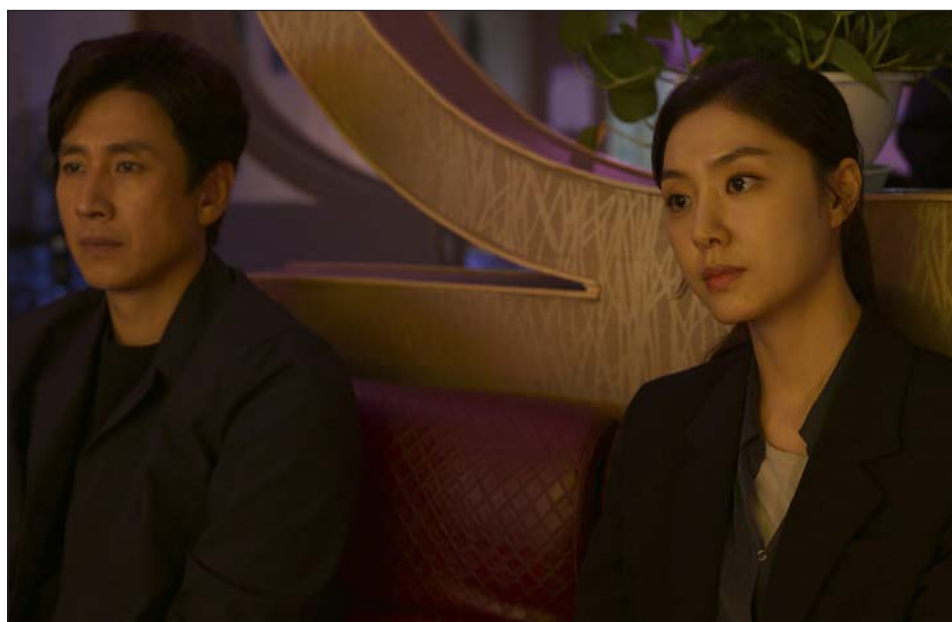
Lee Sun-kyun and Seo Ji-hye in Dr. Brain , premiering on Apple TV+ in Korea on 4 November 2021

Established in 1961, Munhwa Broadcasting Corporation (MBC) is a public broad-