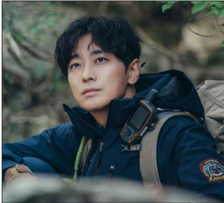
Ju Ji-hoon as Kang Hyun-jo in Jirisan

Korean mystery drama Jirisan failed to maintain its opening highs in its second weekend on air, closing with average viewer share of 7.850% (AGB Nielsen, nationwide) for its third episode on Saturday (30 Oct) and 9.384% for episode four on Sunday (31 Oct). tvN's 16-episode KRW32 billion/US$27 million series debuted on Saturday night (23 Oct) with an average audience share of 9.097% – a record premiere for a tvN weekend drama. Jirisan 's average audience share for Sunday night (24 Oct) rose to 10.663%. Jirisan , which streams as an iQiyi original, runs to 12 Dec.