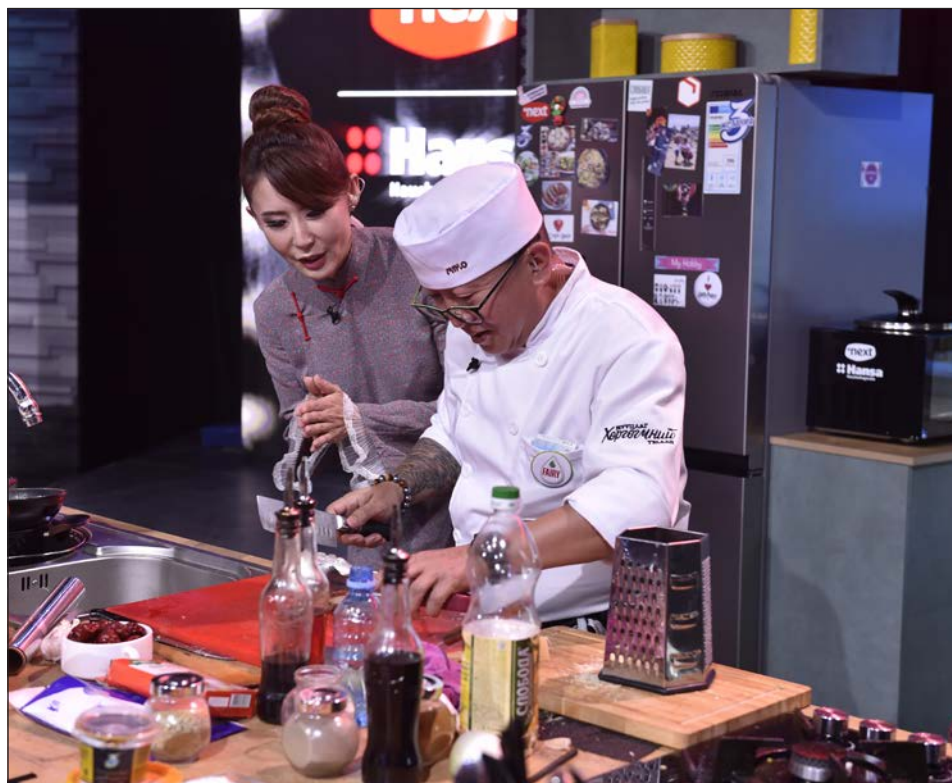
Fridge Wars, NTV/Bomanbridge Media

Mongol Mass Media's TV subsidiary, Eduainment TV (EduTV), launched in July 2007, focuses on education/enter-