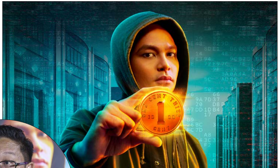
One Cent Thief

Palermo says the TV version inspired by the real-life drama is less about the crime than a human story involving