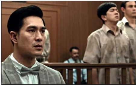
This Land is Mine . Weiyu Films for Mediacorp

Singapore period drama, Weiyu Films' This Land is Mine for national broadcaster Mediacorp, has been shortlisted in the drama category for this year's Rose D'Or Awards.