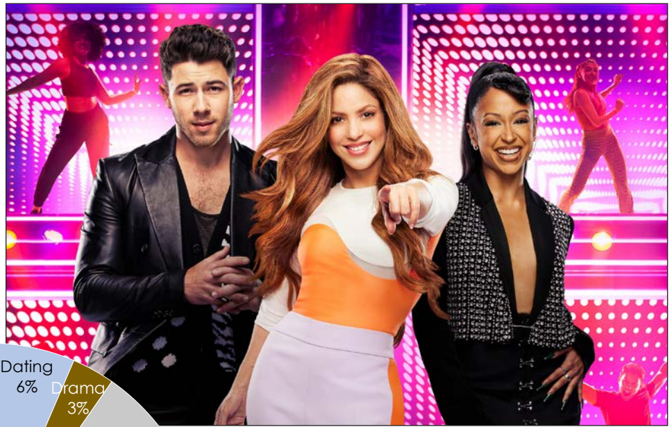
U.S. judges, Shakira, Nick Jonas and Liza Koshy

A fourth season of Thai format, Singer Auction (13x60 mins) – a co-development between Thailand's Zense Entertainment and Universal International Studios – premieres on free-TV network VTV3 on 26 October.