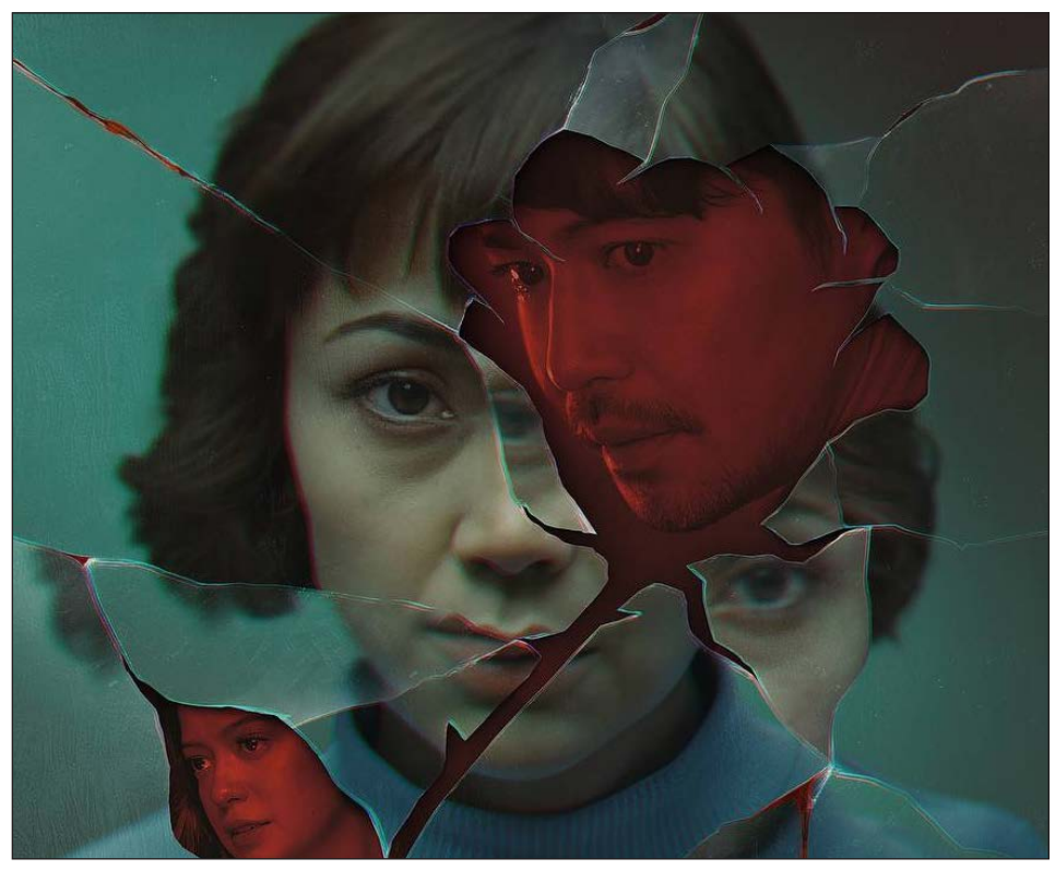
ABS-CBN's romance/thriller The Broken Marriage Vow, airs weeknights at 8.40 pm on Kapamilya Channel, A2Z, TV5, and Kapamilya Online live on ABS-CBN Entertainment's YouTube channel and Facebook page. New episodes of the series stream on iWantTFC and Viu 48 hours before its TV broadcast.

GMA Network (founded in 1950) began broadcasting free-TV GMA-7 in 1961. Today, GMA Network operates two free-to-air channels (GMA-7, GTV), digital channels (Heart of Asia, Hallypop and I Heart Movies), and 23 radio stations nationwide. GMA-7 is a general entertainment channel. GTV (launched in Feb 2021 to replace GMA News TV), focuses on news and entertainment content. Based on Nielsen Philippines TV Audience Measurement's Total Philippines data for full year 2021 (from 1 January to 31 December), GMA registered a net reach of 95.7% with an estimated 83 million TV viewers nationwide. GMA was the most watched channel in Total Philippines for the period with 46% people audience share. GMA's net